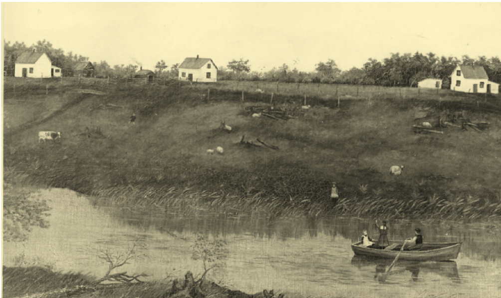
Figure 15 The Borgfjord family homestead in the Geysir settlement, as it appeared around the turn of the century. For 12 years these homes marked the western fringe of settlement along the Icelandic River.