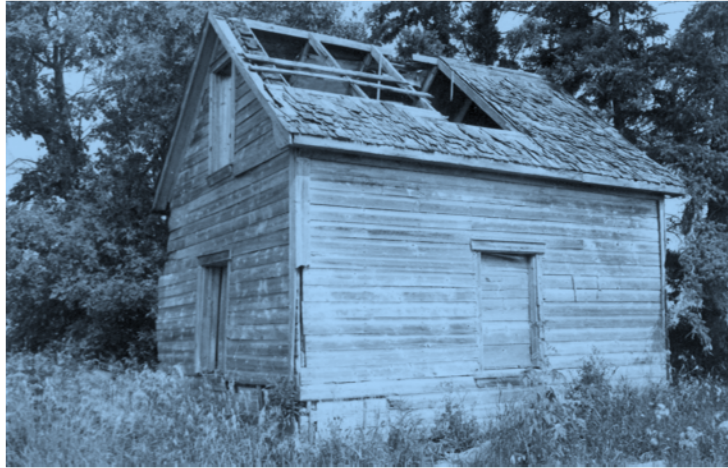
Figure 14 Oddliefson house, SE 19-22-3E, 1890. Later improvements to this log structure included a wood frame shed-roofed kitchen addition, wood siding on the exterior walls, flush board siding on the interior walls and two layers of construction paper on the walls and roof of the upper level.